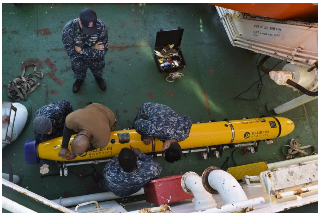
U.S. Navy sailors with the Unmanned Undersea Vehicle Squadron 1 preform maintenance on a Bluefin-12D UUV in November 2017.

Although it is dwarfed by research spending, some of the most significant shifts in terms of maritime drone spending occurs on the procurement side. After years in development, the Navy plans to begin purchasing the Knifefish unmanned underwater vehicle. The Navy intends to spend $47.5 million to purchase three Knifefish UUVs (1601 and 2622) and an additional $16.7 million on Knifefish product research and development (PE 0604028N). The Knifefish is part of the suite of unmanned mine countermeasure systems planned for the Navy’s Littoral Combat Ship. As part of this package, the Navy will also spend $12.1 million to purchase one Unmanned Influence Sweep System, an unmanned surface vehicle built by Textron, and